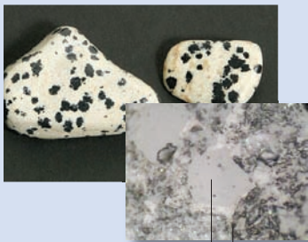
Quartz Black mineral